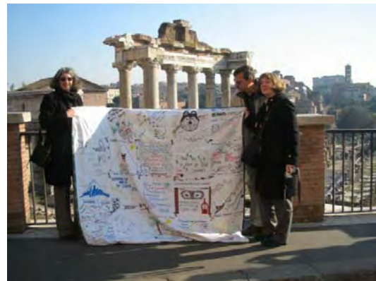
The quilt went to Rome.