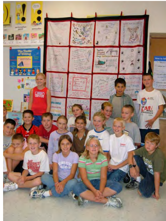
Students enjoy 'meeting' the quilt!